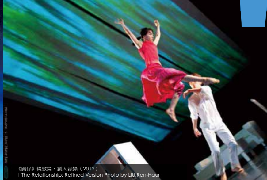
《關係》精緻篇，劉人豪攝（2012） | The Relationship: Refined Version Photo by LIU, Ren-Haur

Nominated for the Performing Arts category in the 11th Taishan Art Awards, this production believes that relationships are like plants. They need be to be cultivated with genuine, hands-on care in every developmental stage. An untended relationship is doomed to wither and die!