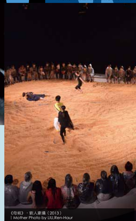
《母親》，劉人豪攝（2013） | Mother Photo by LIU, Ren-Haur

2012年甫開春，顏鳳曦就帶領「風乎舞雩跨領域創作聚團」的一群年輕生命，在古都臺南再度投下一顆震撼彈。在緊密的黑盒子中，觀眾席不斷傳出低低的讚嘆聲。