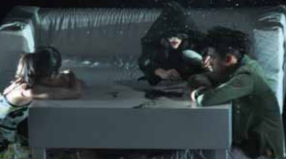
《關係》精緻篇，劉人豪攝（2012） | The Relationship: Refined Version Photo by LIU, Ren-Haur

The Chinese name "Feng-hu-wu-yu" refers to "enjoying the breezes on Wuyu Terrace". To achieve greatness, one must be fearless yet pay meticulous attention to detail. Up to this day, originality and a daredevil attitude with fastidious techniques are still indispensable to the creation of new masterpieces. Fengdance explores and examines all possibilities of dance as an art. This allows the dance theater vigilance and a growing strength in discovering potentials and fulfilling dreams.