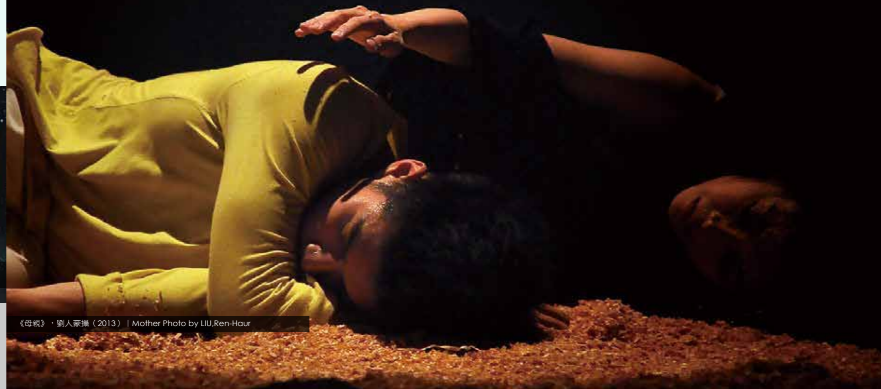
《母親》，劉人豪攝（2013） | Mother Photo by LIU, Ren-Haur

Spring 2012 see Dominique Yen leading young members of Fengdance to once again bedazzle Tainan minds with its annual production: The Relationship, as it keeps drawing gasps of awe from the audience in an enclosed black box. -Tai Juan-Ann, China Times, Taiwan