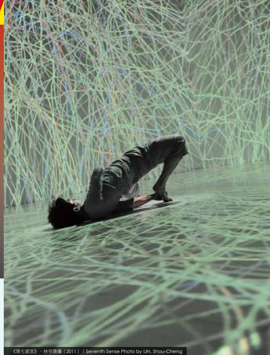
《第七感官》（2011） | Seventh Sense