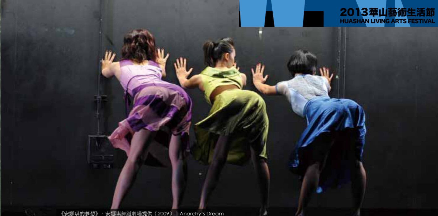
《安娜琪的夢想》，安娜琪舞蹈劇場提供（2009） | Anarchy's Dream