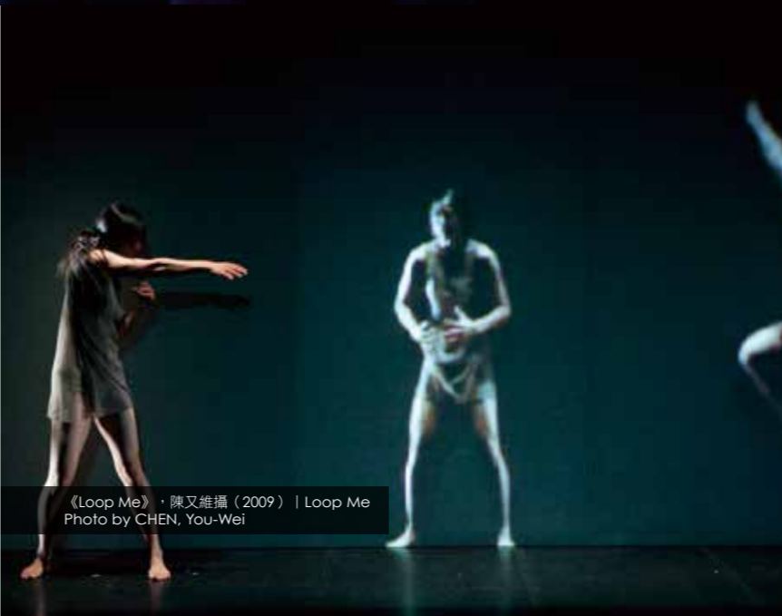
《Loop Me》，陳又維攝（2009） | Loop Me Photo by CHEN, You-Wei

It examines how our lives have been and are transforming in an increasingly complex urban environment - a movement from natural to artificial and even alienated spaces, and from sensory experience of social spaces to the virtual network.