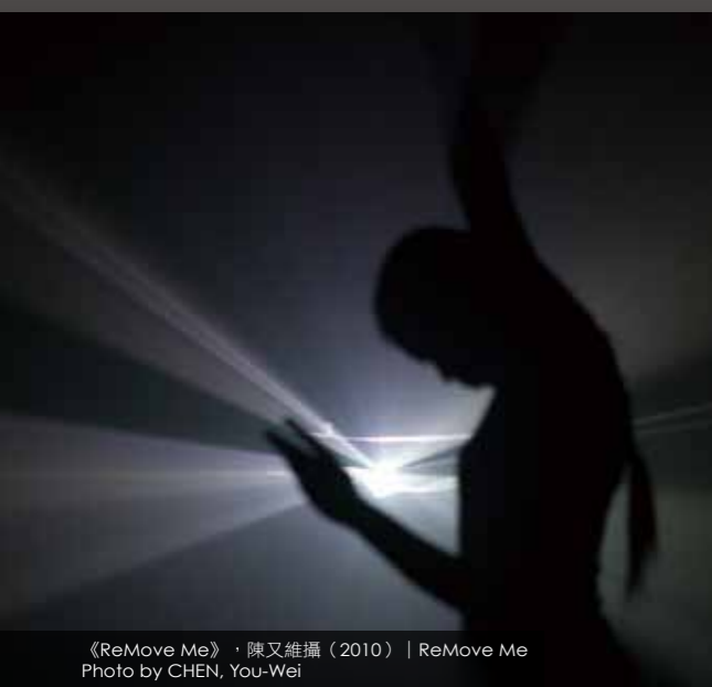
《ReMove Me》，陳又維攝（2010） | ReMove Me Photo by CHEN, You-Wei

Through the representation of whole picture, the dialogue and corresponding position between performer, light and shadow turn the performance into a fantasy journey which leads the audiences and the work proceed together with delight and agitation. - LEE, Yi-Hsuan, Guling Street Avant-garde Theatre News Letter, Taiwan